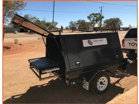
The new barbecue trailer in Atitjere.