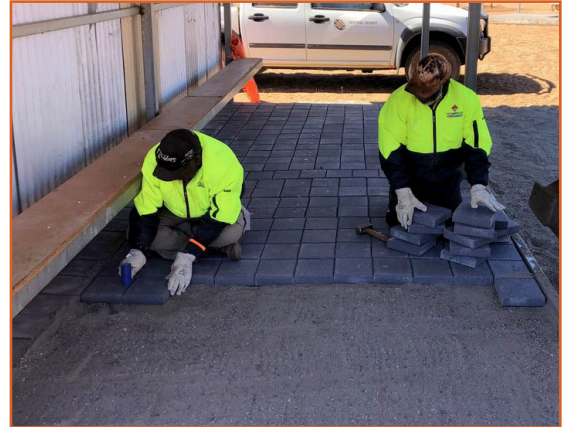
The Engawala Works team paving one of three shade structures for the softball field.