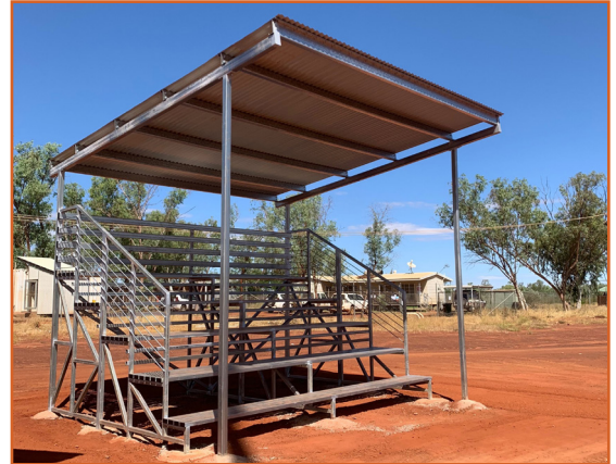
One of two new grandstands at the football oval.