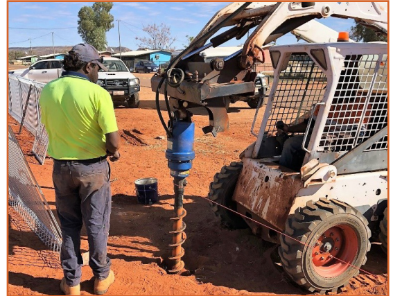
CDRC works crew and the Community Development Program digging post holes for the new park fence.