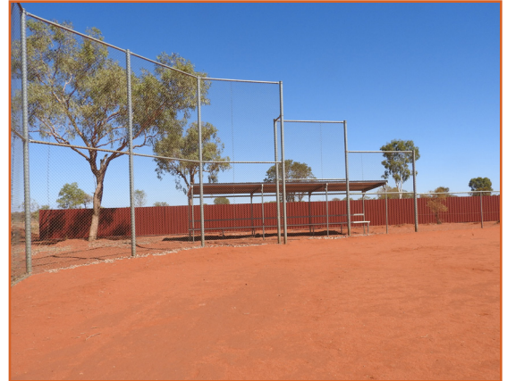
The softball oval with screen and grandstand completed.

Nyirripi is located approximately 440 km from Alice Springs by road, or 5.5 hours drive. Nyirripi has an airstrip, Centrelink office, post office, child care, aged and disability service, community safety patrol, a store with fuel, gymnasium, health clinic, an unmanned police station, school, church, youth centre and rec hall, learning centre and PWA media. Nyirripi is also home to the Nyirripi Demons.