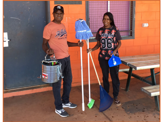
Residents collecting their cleaning and gardening packages from the Willowra office.