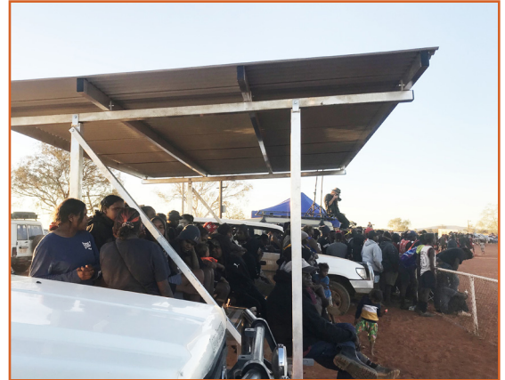
The new grandstand at the football oval.

Yuendumu is located 290km north west of Alice Springs, about 3.5 hours drive. Facilities and services include a health clinic, post office, arts centre, Central Land Council office, school, Community Development Program (CDP), Centrelink, WYDAC, PAW Media, full time police station, three stores and three fuel outlets, op shop, Community Safety Patrol, womens' centre, men's shed, visitor's accommodation, mechanic, womens' safe house, aged care, sport and recreation facilities, early learning centre, swimming pool, mediation and justice program, several churches and Christian service delivery outlets.